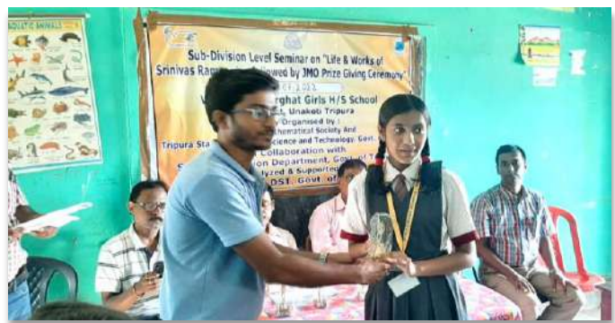
Kumarghat Sub-Division. Our Class VIII students

Tripura Mathematical Society organized a sub-divisional level JMO for all the schools of